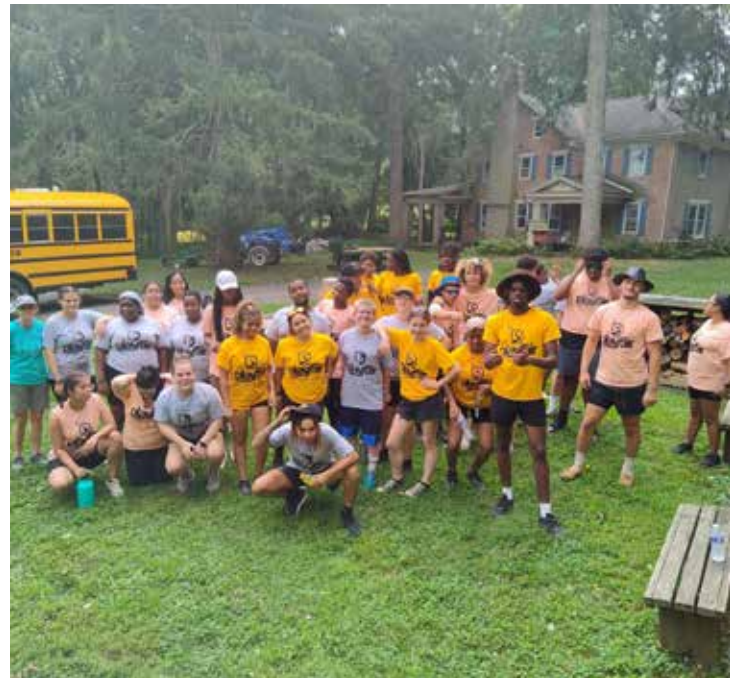
Millersville University summer scholars harvest over 1,100 pounds of tomatoes in 2 hours.