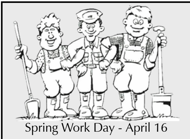
Spring Work Day - April 16