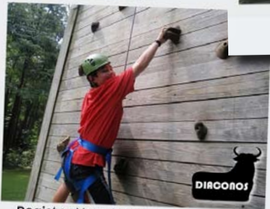
Register Your Youth Group Today for the Diaconos Program in 2011 LutheranCamping.org/diaconos