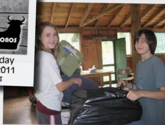
Number of Blankets and Sweatshirts Collected at Nawakwa for the Fruitbelt Farmworker Christian Ministry: 128