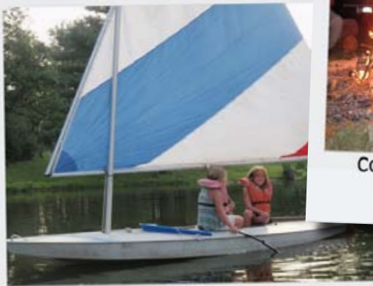
Summer Campers at Kirchenwald: 440