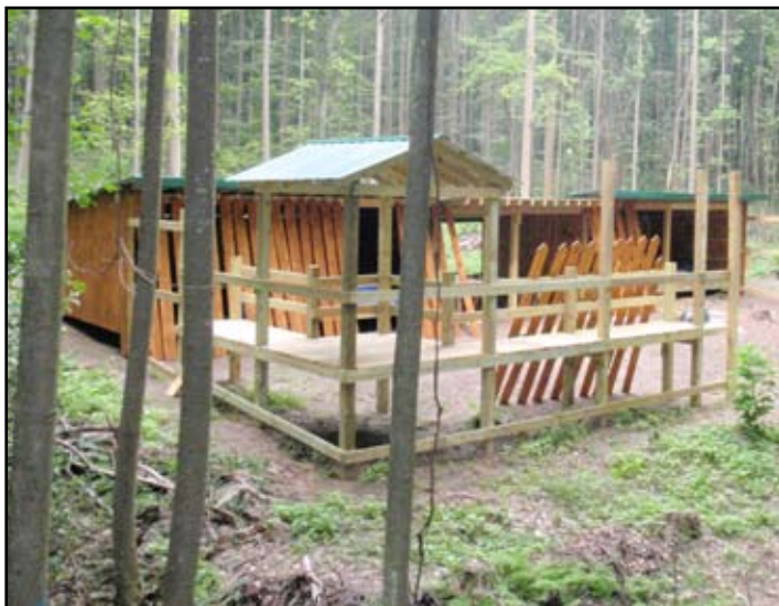
Fort K Under Construction

Maintaining and improving the farm and camps is expensive. Your contributions help make repairing and improving our facilities and grounds possible.