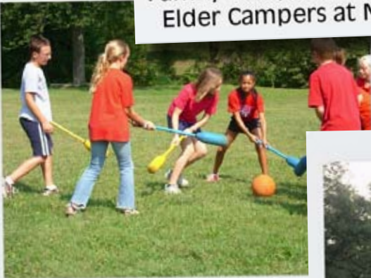
Summer Campers at Nawakwa: 570