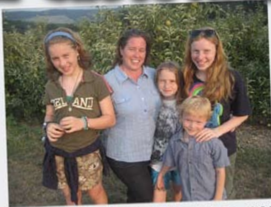
Family Campers at Nawakwa: 268 Elder Campers at Nawakwa: 11