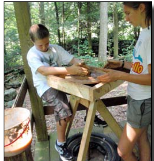
A camper making pottery on the kick wheel