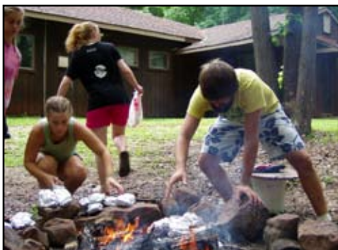
A group cooking out in front of Myers Retreat Center

In 1974, a unique partnership began between Grace Lutheran Church, Lancaster and Camp Kirchenwald, when Grace built the Myers Retreat Center