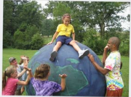
Congregation Sending the Most Campers to Nawakwa: Tree of Life, Hbg - 48