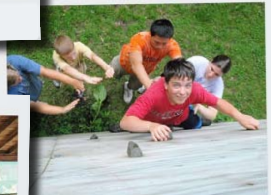
Most Popular Specialty Camp Kirchenwald: High Adventure - 39 Nawakwa: Survivor Nawakwa - 26