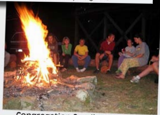
Congregation Sending the Most Campers to Kirchenwald: Holy Trinity, Lebanon - 26