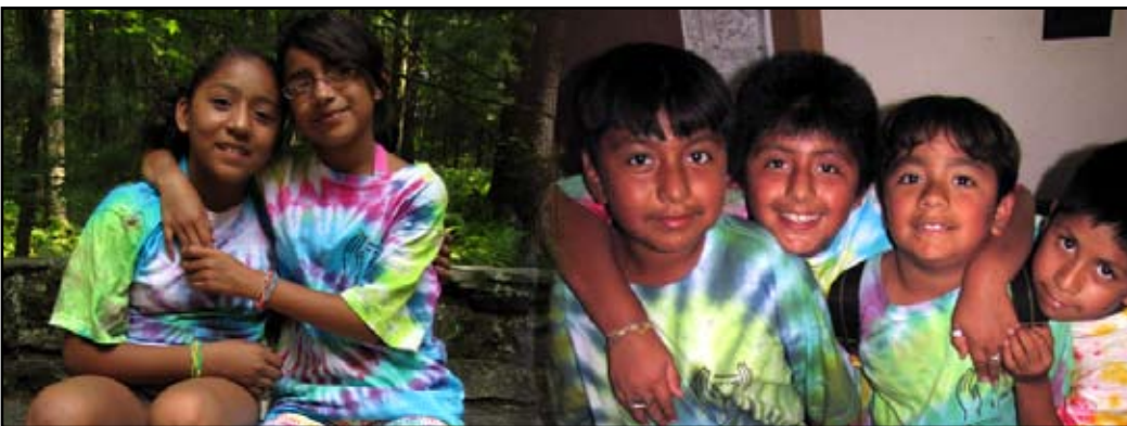
Manos Unidas Campers Posing in Their Tie-dyed Shirts

at the dining hall. Friday's macaroni and cheese noon meal was augmented by grilled chicken, quesadillas, and the remaining spicy salsas from the previous evening's picnic.